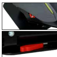
Swivel function (top), Trigger for rotary function (bottom)

**** Lateral trunk supports firm and lateral trunk supports swing-away cannot be used in combination