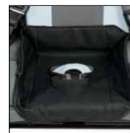
Incontinence seat cover