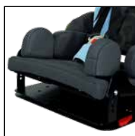
Tilting function 10° (0° / 2,5° / 5° / 7,5° / 10°)