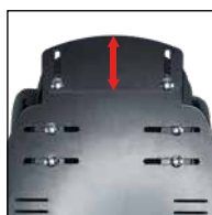
Additional extension (head area height)