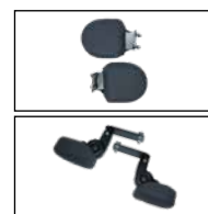
Lateral trunk supports, firm (top), Lateral trunk supports, swing-away (bottom)