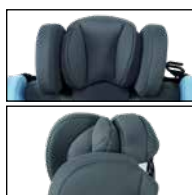
Head additional cushion (top), View of Mounting (bottom)