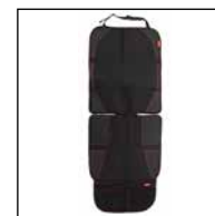
Car seat protection mat incl. back