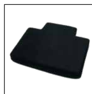
Cushion for function base