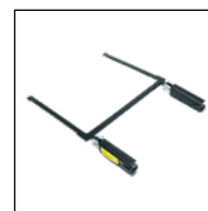
Seatfix adapter, behind the seat