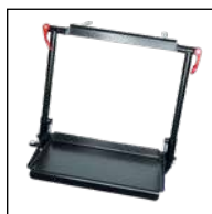
Footrest, foldable (height and angle adjustable)