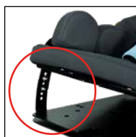
Extension Tilting function 12,5° - 20° (12,5° / 15° / 17,5° / 20°)