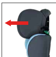
Headrest, additional extension (depth)