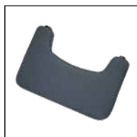
Table (only in combi- nation with the armrests)