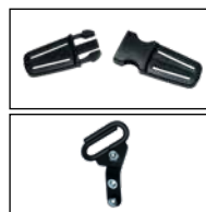
Chest clip (top) Second belt guide, top (bottom)