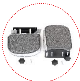
head / torso adjustable pads