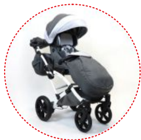
winter sleeping bag