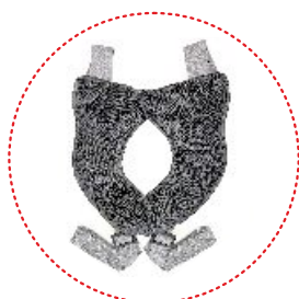
abduction and stabilizing belts